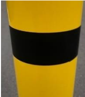
1 black tape