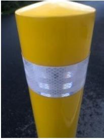
1 reflective tape